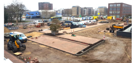
The view from the roof of the Lidl market shows the size of the building site.