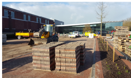
The parking lots are covered with concrete pavers.