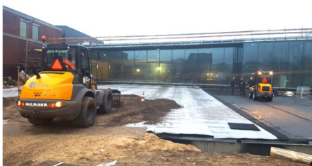
This photo shows the sequence of all layers from the waterproofing to the base layer.