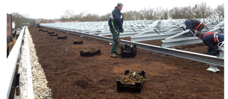
The Sedum plug plants are planted on the roof.