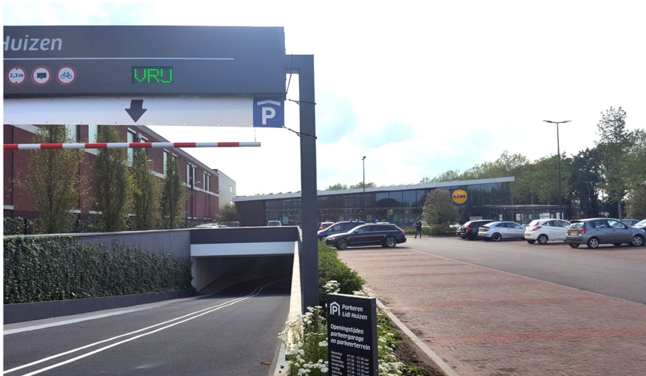
Underground garage with additional benefit: As space is limited in urban areas, cars park on several levels.