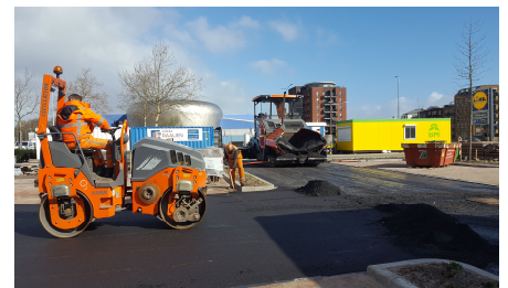
Heavy vehicles can drive on Elastodrain® EL 202 to asphalt the driveway.